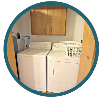
Main Floor Laundry