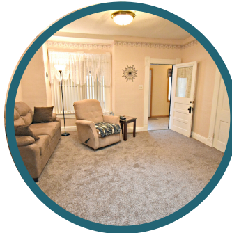
Large Living Room