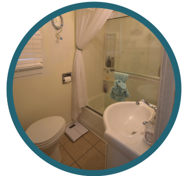
Main Floor Bathrooms