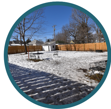
Fenced In Backyard