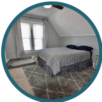
Large Master Bedroom